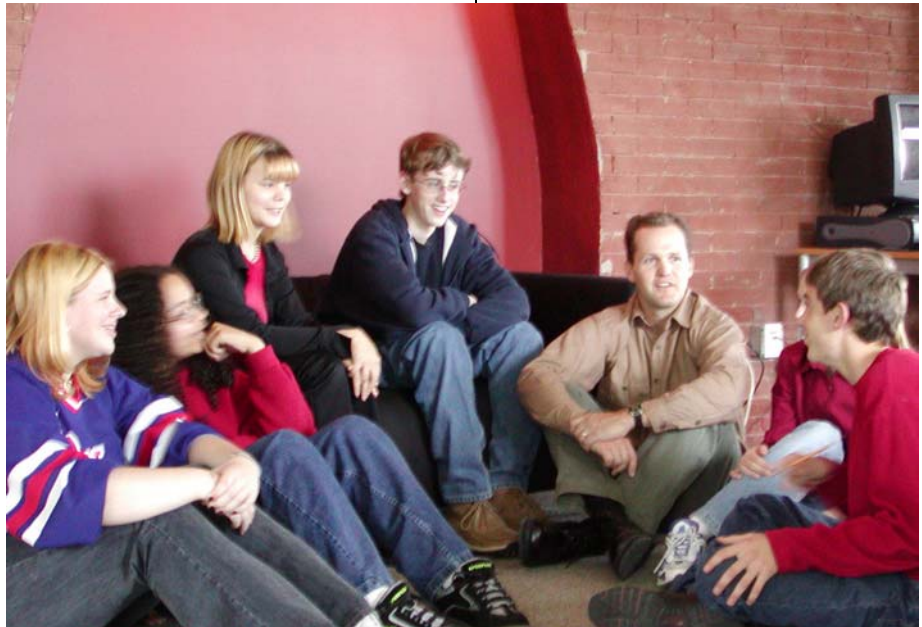
At the Met School in Rhode Island, advisories remain in place throughout a student's high school years.

The move is gaining momentum to break up larger, comprehensive high schools all across America into themed academies. The Bill and Melinda Gates Foundation has set aside tens of millions of dollars toward this cause. There are national and statewide networks that assist schools in setting up academies. The largest such organization is the New York City-based National Academy Foundation with over 1,000 member academies around the country. NAF defines its mission thus, "The mission of the National Academy Foundation (NAF) is to sustain a national network of career academies to support the development of America's youth toward personal and professional success--in high school, in higher education, and throughout their careers." 5 In California, the "Career Academy Support Network is housed within the Graduate School of Education at UC Berkeley. Its purpose is to support the growing number of career academies developing around the country,